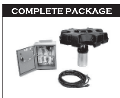
U.S. Package: Unit, NEMA 3R Power Panel (with timer, GFCI (except 460V), breaker, surge arrester, HOA switch and thermal overload protection), 50 ft. of SOOW cable. Int'l Package: Unit and 15m of cable (no cable on CE).