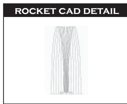
Line drawing of the 3HP Rocket unit, for a more detailed diagram of this and other models visit www.caddetails.com