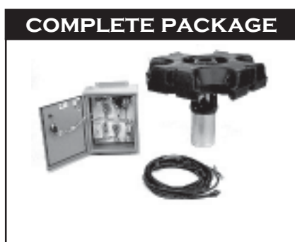
U.S. Package: Unit, NEMA 3R Power Panel (with timer, GFCI (except 460V), breaker, surge arrester, HOA switch and thermal overload protection), 50 ft. of SOOW cable. Int'l Package: Unit and 15m of cable (no cable on CE).